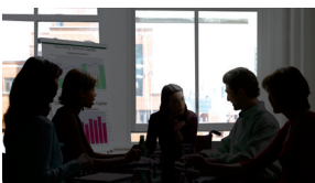
Without View-DR function

In addition, outstanding View-DR™ technology expands the dynamic range for clear images under harsh backlighting with extremes of light and dark in the same scene. XDNR™ technology reduces image noise for crisp reproduction of still and moving objects in poorly illuminated rooms.