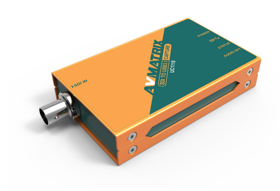
SDI to USB3.1 Gen 1 Video Capture User Manual V1.0