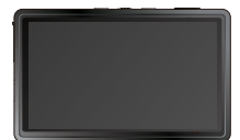
• Portable DVR PV-500EVO2 PV-1000Touch5

*Specifications are subject to change without prior notice.