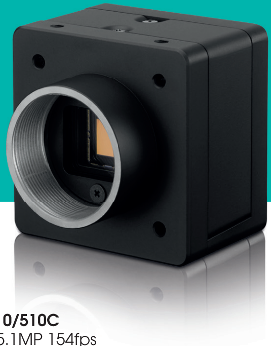
XCL-SG510/510C 2/3-type 5.1MP 154fps

The new XCL-SG510 (monochrome) and XCL-SG510C (color) integrate Sony's 2/3-type CMOS image sensors with a global function that can accurately capture high-speed moving images. These cameras realize 5.1-megapixel resolution with 154 frames per second (fps) in 80 bit configuration. They offer some unique image processing features such as Wide dynamic range and Frame accumulation. In addition, these new cameras incorporate advanced features such as Area gain, Multi ROI and Area Exposure.