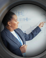
Presenter HDMI camera 1