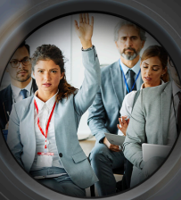
Audience interaction AI USB camera 2