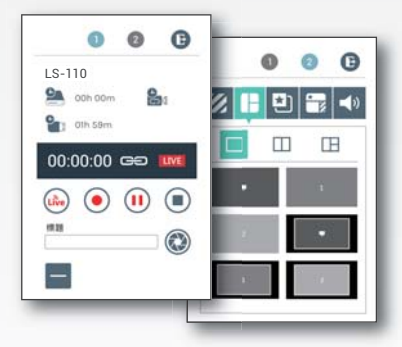
Mini Controller from Mobile Device

*The on-screen GUI supports mouse device control through USB connection.