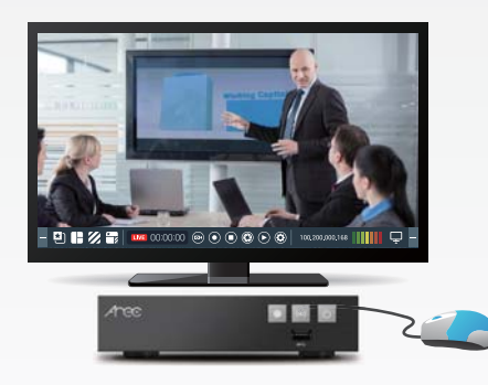
On-screen GUI & USB Interface*

AREC Online Director supports a wide range of control options, including Web Browser (IE, Firefox), Software Application (Windows, Mac OS), Touch-Friendly Graphical User Interface, and Mini Controller from Mobile Device. Control buttons on the front of LS-110 are also provided for easy operation.